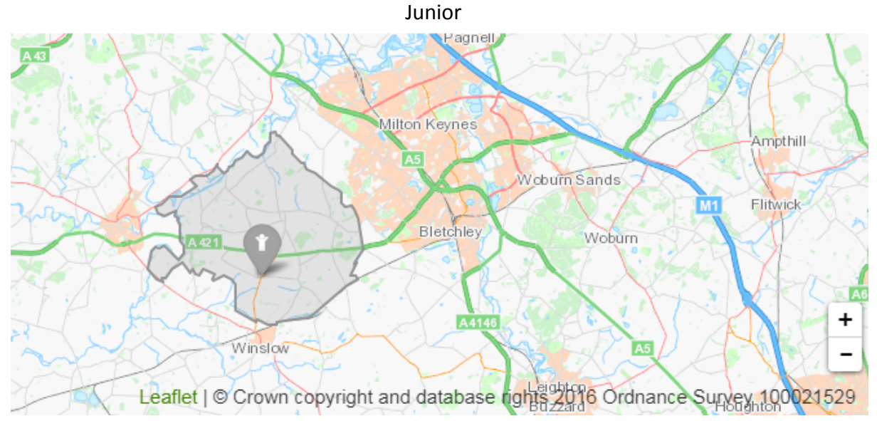
All Other Admissions

Admission to the school during the school year depends on whether or not there are places available. All year groups at the school have 15 places in Key Sage 1 and 30 places in Key Stage 2.